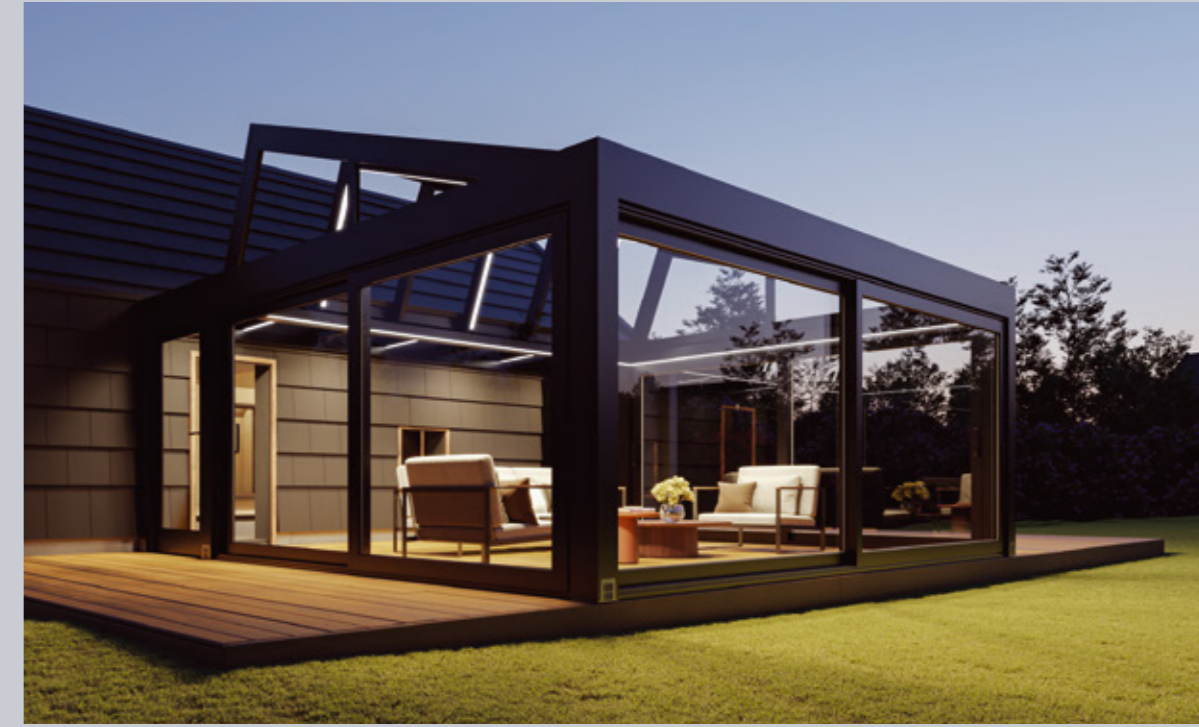
WINTERGARDEN / SUNROOM

There is no need to carry the realities in your dreams. Comfort wrapped in shield. Polad system, designed by talented Schildr engineers known for their innovative approaches, stands as a pioneering winter garden model that seamlessly blends classical and modern design elements. In many regions, the challenge of varying back heights during winter garden assembly is a common issue. Steel structure embedded in aluminum profiles addresses this concern by ensuring an equal load distribution across the floor, which makes it different from numerous other winter gardens. Depending on the spacing between the supports, it allows for a convenient connection of the system's perimeter with panoramic sliding systems. A well-conceived water channel integrated throughout the system efficiently and quietly directs excess water out through a plastic conduit. This model offers users superior comfort, clear panoramic views, excellent illumination, year-round usability, and direct communion with nature.